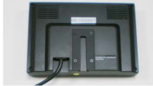
(Back Side View)